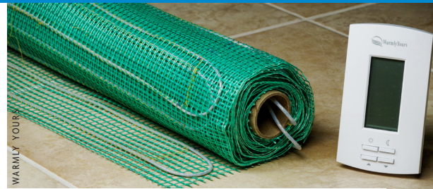
This electric floor radiant heating kit has the heating cable spaced properly in an easy-to-use mesh. This is ideal for tile floor applications.

With the low intensity heat arising from the floor and less air movement, there is less heat stratification in the room. This means less hot air ends up collecting at the ceiling