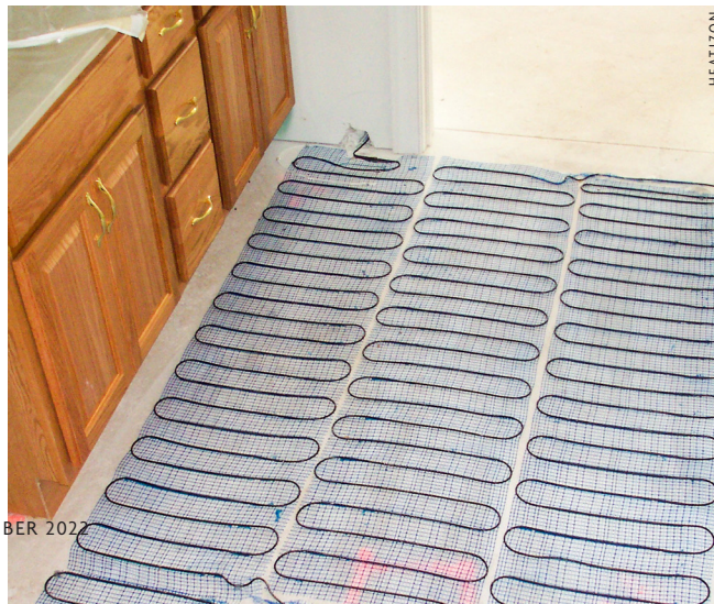
Electric radiant heating cable/mesh is placed on a kitchen floor before the ceramic tile is installed. The manufacturer can advise about how much is needed for the room size.