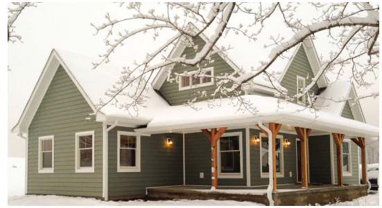
The Cold Weather Rule helps existing consumer-members maintain electric services during the winter.

Under the rules of both organizations, individuals who are unable to pay their bill and would like protection under the cold weather rule must call Twin Valley's office at 866-784-5500 to make a payment arrangement. In order to remain protected by the cold